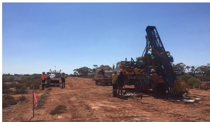
Figure 1 Aircore drilling underway at the Atlanta South Prospect – 30 January 2019.

The Apollo Hill Gold land package (located near Leonora in the Western Australian Goldfields) is centred around the Company’s flagship Apollo Hill Mineral Resource which currently contains 20.7Mt at 1.0g/t Au for 685,000oz. Details of the Mineral Resource breakdown by category are presented in Table 1