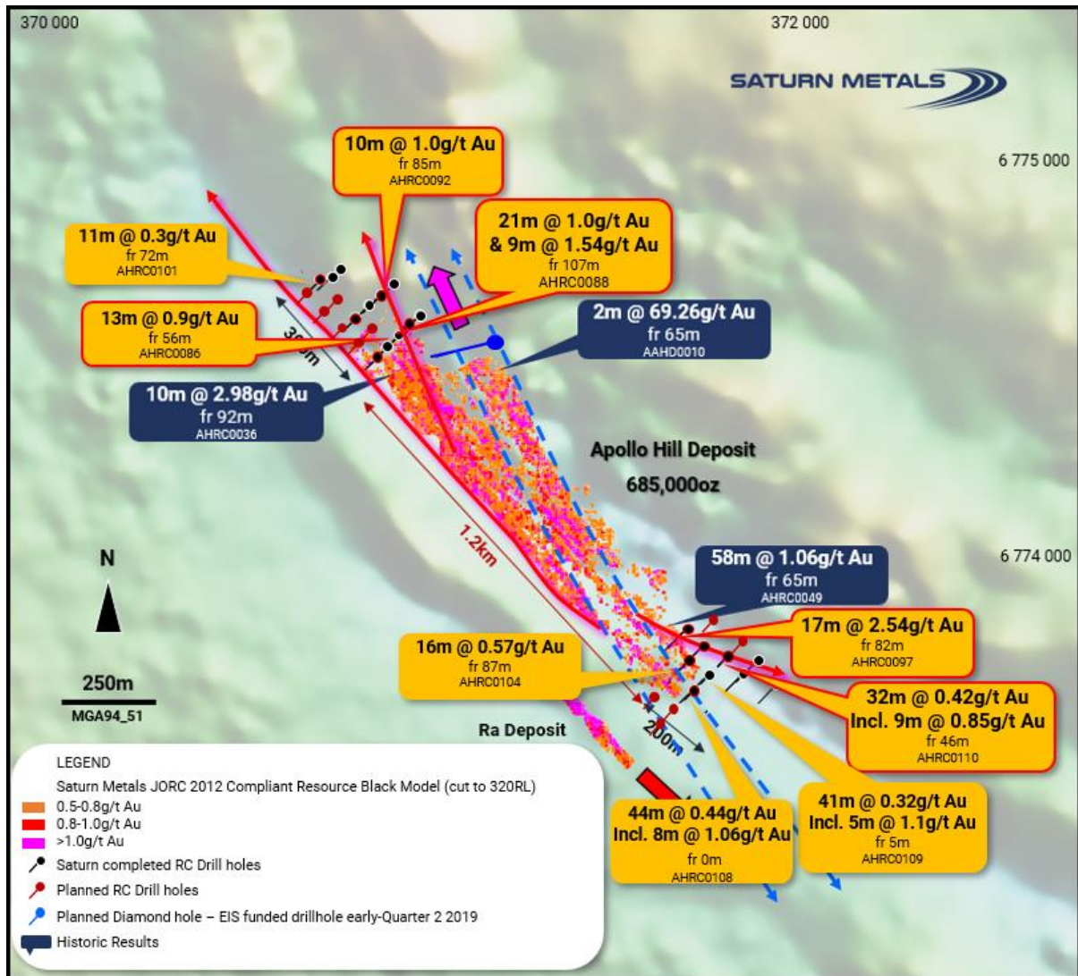
Figure 1 RC drill results relative to the published resource. Drilling results have expanded the 1.2km long mineralised system by an additional 500m strike length. Magnetic data collected in 2018 is providing a new targeting tool for future drilling. 2 Drilling results depicted originally reported in fuller context in Saturn Metals Limited ASX Announcements, Quarterly Reports and Prospectus - as published on the Company's website. Saturn Metals Limited confirms that it is not aware of any new information or data that materially affects the information on results noted.