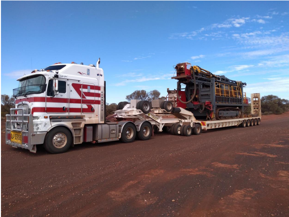
Figure 2 Track mounted RC drilling rig arriving at Apollo Hill – 23 March 2019. A track mounted drill rig is being used to improve access to several drill pads on the lakeshore at Apollo Hill and to several drill pads on the side of Apollo Hill; drill pads being used respectively to test Apollo Hill southern extensions and hanging wall lodes.