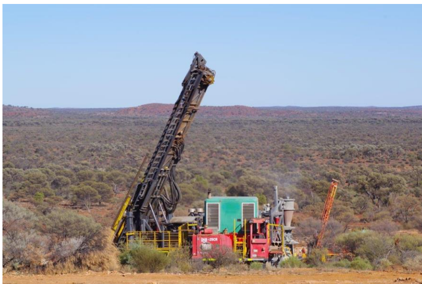
Figure 2 Two drill rigs at Apollo Hill; 1 April 2019, Diamond Drill Rig in the back ground.