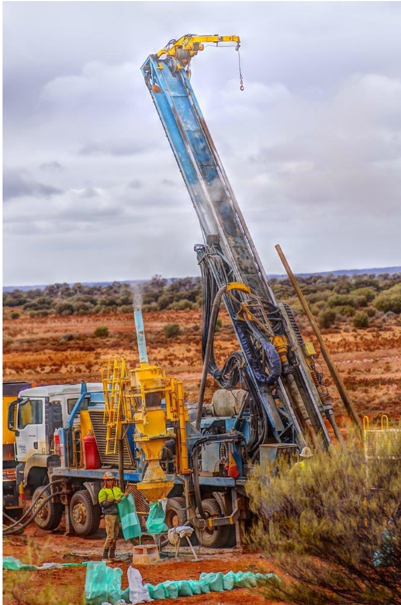
Figure 2 RC drilling underway at Apollo Hill – 12 June 2019.

A handwritten signature in black ink, appearing to read 'I. Bamborough', is written on a white background.